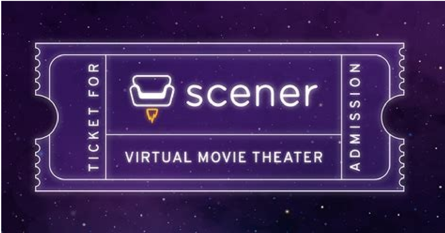
How to netflix party on android. Netflix party explained.